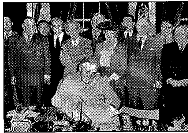
USA PRESIDENT FRANKLIN D. ROOSEVELT signs a bill into law allowing Washtenaw County to launch its Demonstration Project court system.