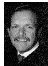
JUDGE SHELTON: You're getting fries with that

Coffee Shop patrons should expect to be better prepared when placing their orders. The public has been advised to "read the menu" carefully and be ready to order when they are called on. Menu substitutions will be allowed, but only on a showing of "good cause."