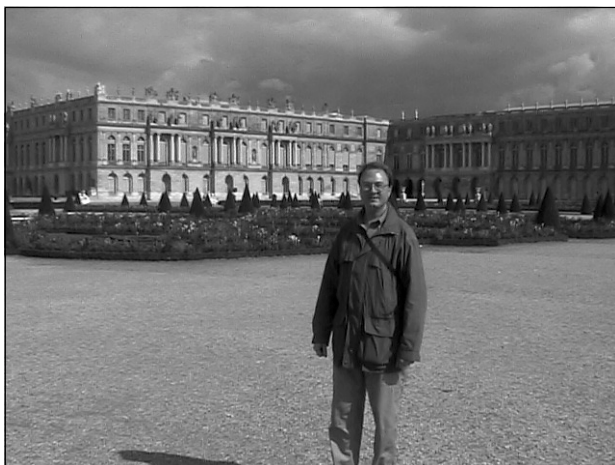
OUR INVESTIGATIVE REPORTER VISITS EMU'S UNIVERSITY HOUSE. The modest structure provides accommodations for EMU's University President and his immediate family.